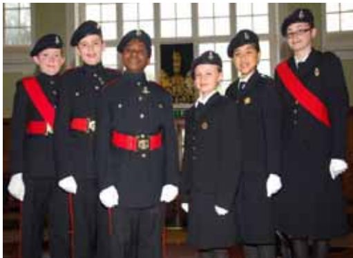
Junior pupils in their blues

Visit the website for more information: www.doymrs.com 01304 245023