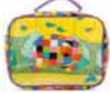
Shreds 'Elmer' lunchbox £11