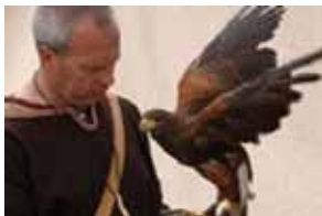
Dover Castle Castle Hill, Dover, Kent, CT16 1HU