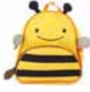
Skip-Hop bumble bee backpack £21

Boys can get top marks in their style too, with back to school favourite brands including Burberry, Mayoral and Scout. AlexandAlexa.com are introducing a wide range of