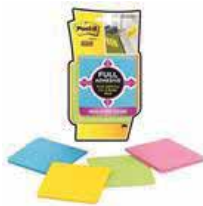
Post-it Notes Handy Ruler Pack RRP £7.20

You can stick the entire pad to something useful like a folder or notebook, ensuring you always have a note handy just when you need one!