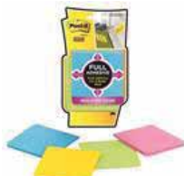
Post-it Notes Handy Ruler Pack RRP £7.20

You can stick the entire pad to something useful like a folder or notebook, ensuring you always have a note handy just when you need one!