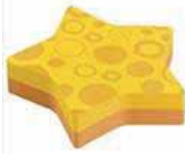
Post-it Apple Pop-up Z-Notes Dispenser & Pad RRP £8.99

They are perfect for ensuring your messages stand out, and because they're Super Sticky, you can be sure they'll stick to most vertical surfaces!