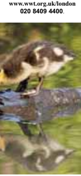
www.wwt.org.uk/london 020 8409 4400.

WWT London Wetland Centre is a 105 acre wetland visitor centre in Barnes, southwest London, an international award-winning visitor attraction and a Site of Special Scientific Interest (SSSI) . It is home to a wide range of wildlife species including birds, water voles, bats and amphibians. Facilities include six wildlife hides, Water's Edge Café, Observatory, a gift shop and free car park. The Centre also has adventure play areas for children. Wetland Centres are easy, safe places to enjoy the wonders of wetland wildlife and a great way to have a taste of the wild without having to get your feet muddy (unless you want to!)